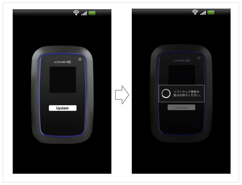
"Updating… Wait for a few minutes (ソフトウェア更新中 数分お待ちください)" is showed in Status Display during upgrade.

① After 101SI completed to connect with WLAN on the upgrade tool, tap the upgrade button and upgrade process will start.